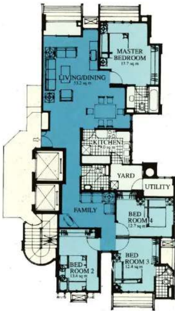
Type B1 Floor Area: 140 sq m