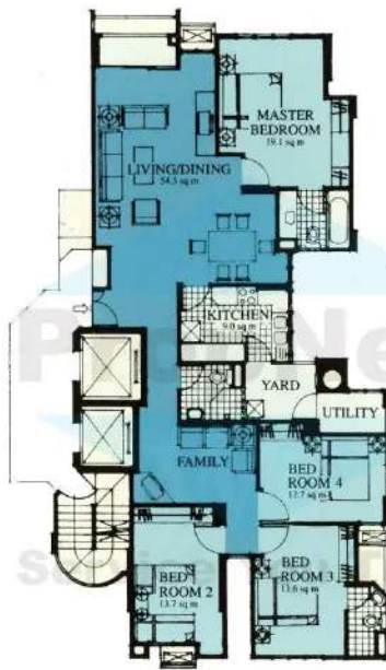
Type B2 Floor Area: 144 sq m