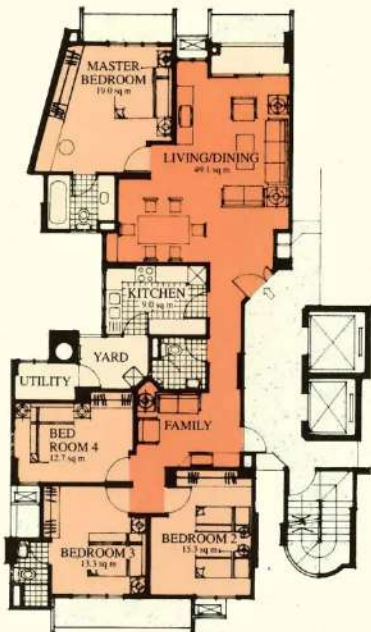
Type E1 Floor Area: 140 sq m