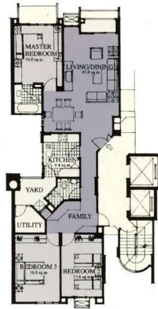
Type C3 Floor Area: 121 sq m