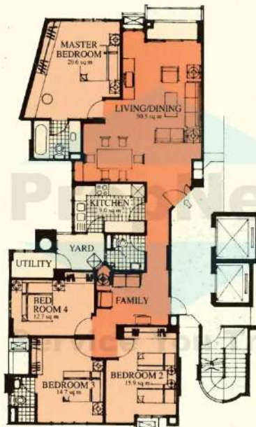
Type E2 Floor Area: 145 sq m