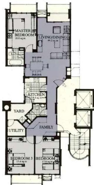
Type C1 Floor Area: 118 sq m