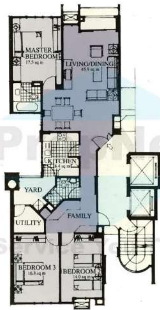
Type C2 Floor Area: 123 sq m