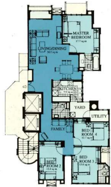
Type B3 Floor Area: 142 sq m