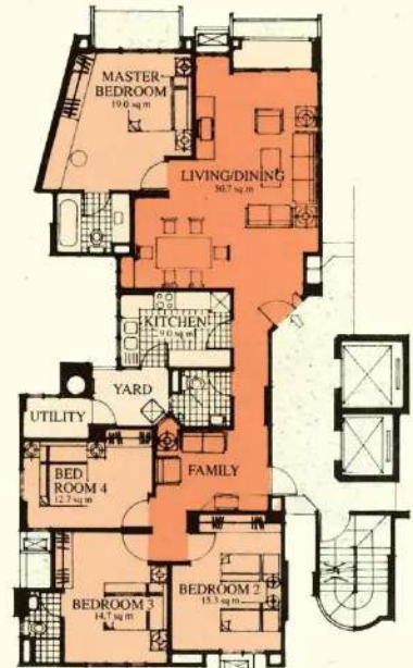
Type E3 Floor Area: 143 sq m