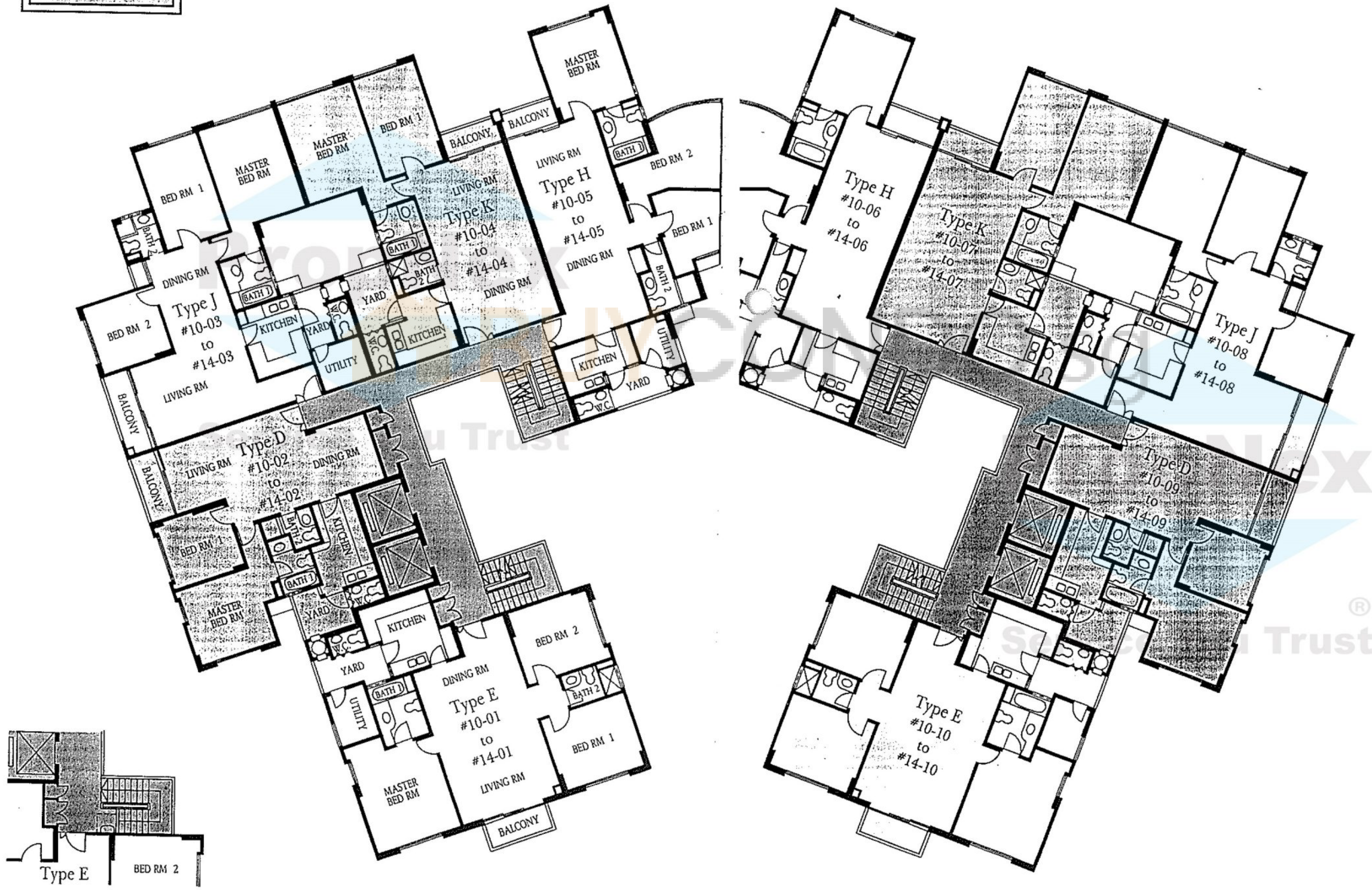
Staircase at 14th storey