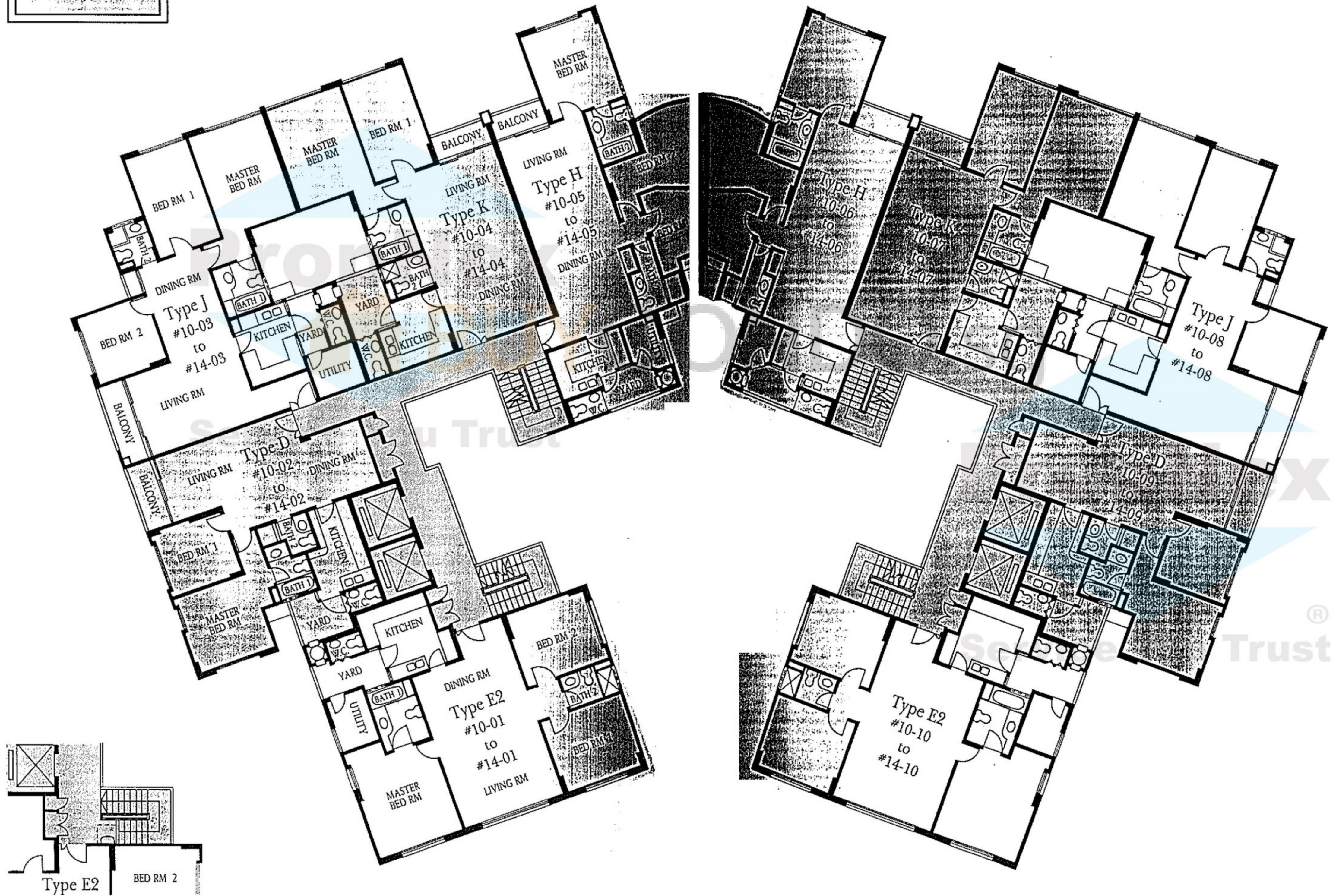
Staircase at 14th storey