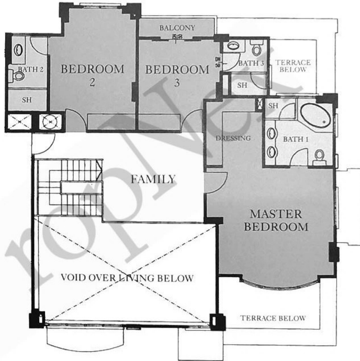
TYPE P 1